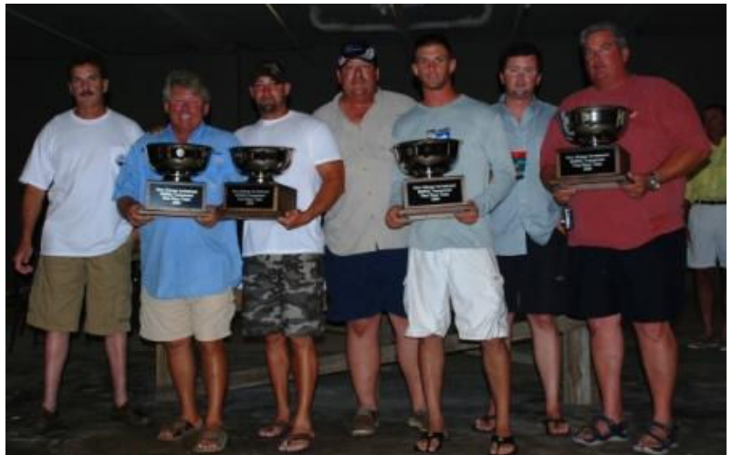
"Brother in Law" Takes Top Team with two Blue Marlin at the Invitational.